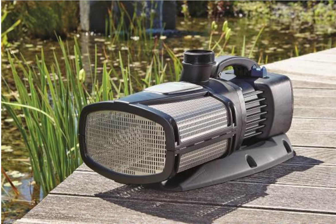
Networksuitable power packs for large-scale plants: The new Aquarius Eco Expert-range by OASE.