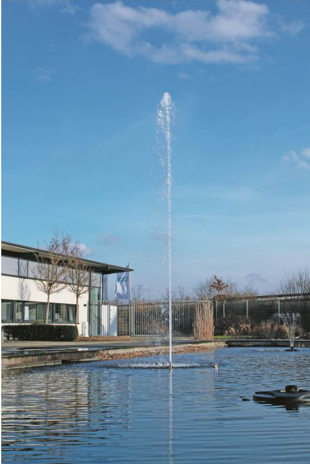
Up to 10 meter fountain height in combination with the Aquarius Eco Expert: The new Cluster Eco Nozzle.