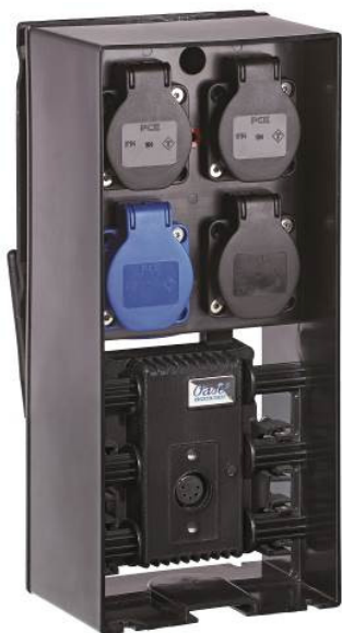
The centrepiece of the Easy Garden Control-Systems: FM-Master WLAN EGC.