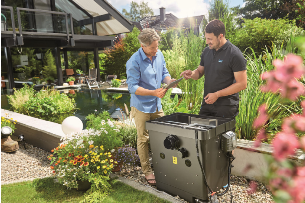
Optimised technology and new digital possibilities: ProfiClear Premium EGC.