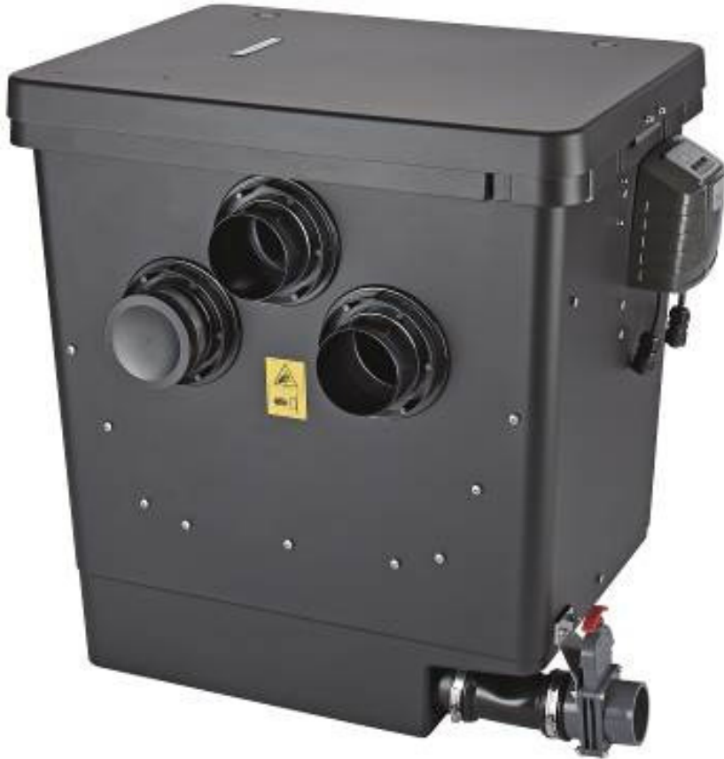
Compakt and powerful: ProfiClear Premium Compact EGC for a gravitational system.