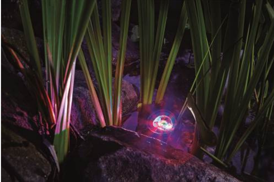
For a colourful garden: ProfiLux Garden LED RGB spotlight.