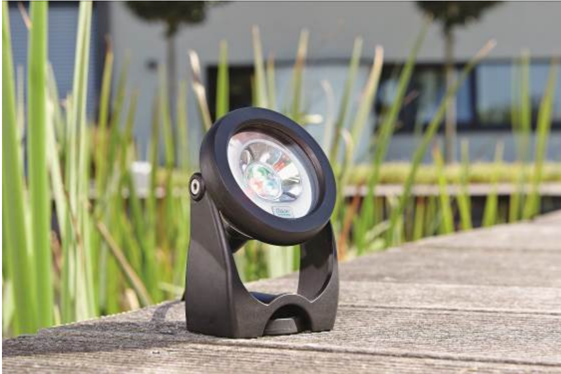
Easy to control via App: ProfilLux Garden LED RGB.