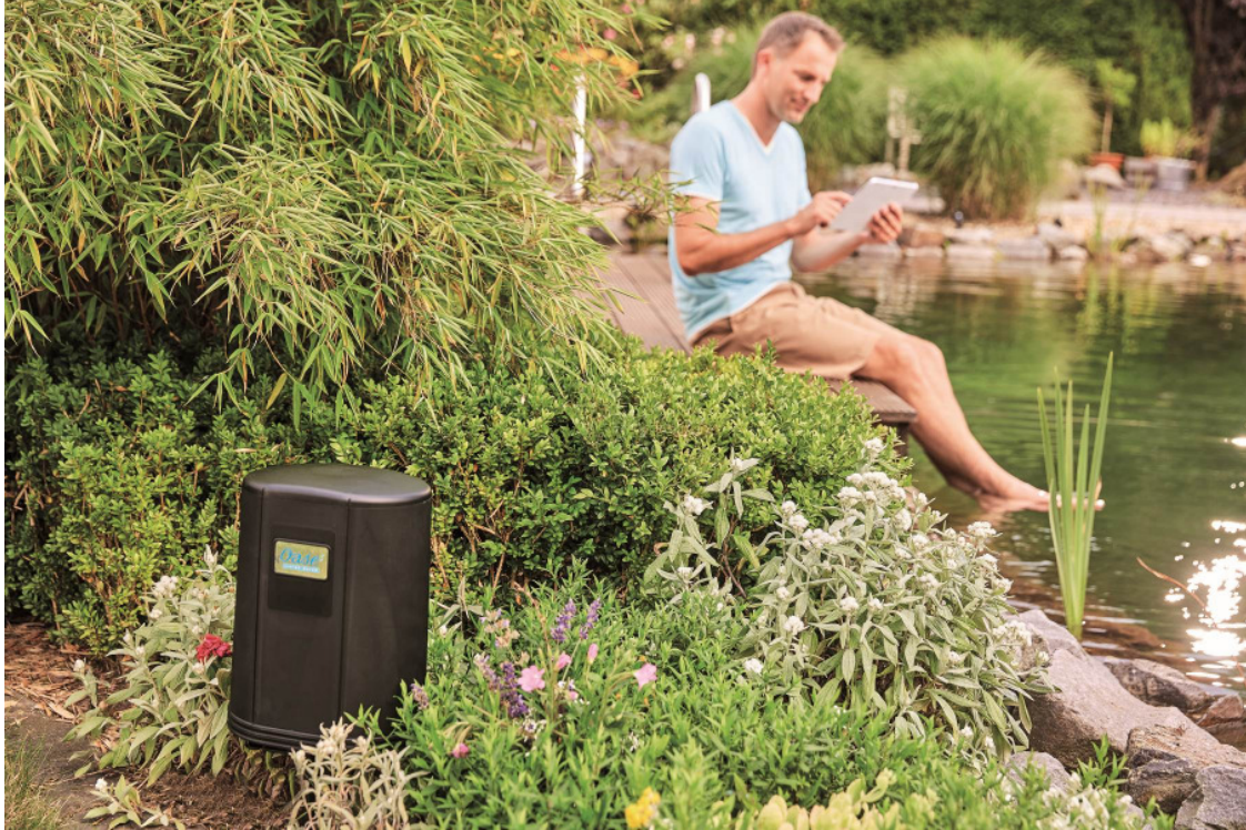
Well hidden: The new top product of the FM-Master range: InScenio FM-Master WLAN EGC.