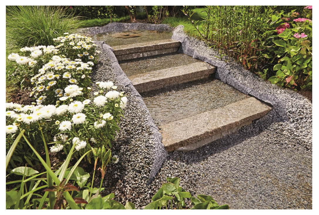
A multitalent: the granit grey stone liner by OASE.

OASE stone liner, granite grey (item 40293; dimensions 0.4 m x 25 m) UVP €12.99 OASE stone liner, granite grey (item 40294; dimensions 0.6 m x 20 m) UVP €18.99 OASE stone liner, granite grey (item 40295; dimensions 1.0 m x 12 m) UVP €29.99 OASE stone liner, granite grey (item 47752; dimensions 1.2 m x 12 m) UVP €35.99