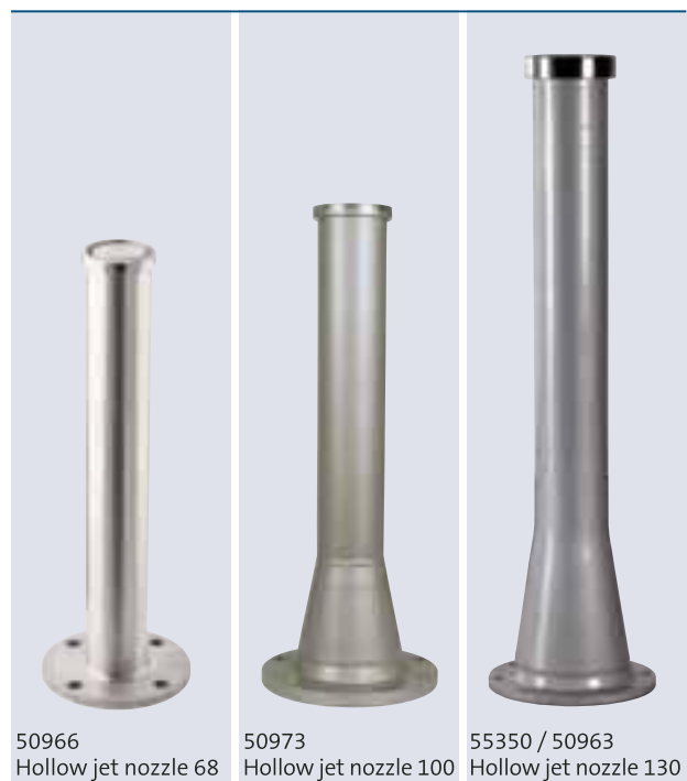
50966 Hollow jet nozzle 68