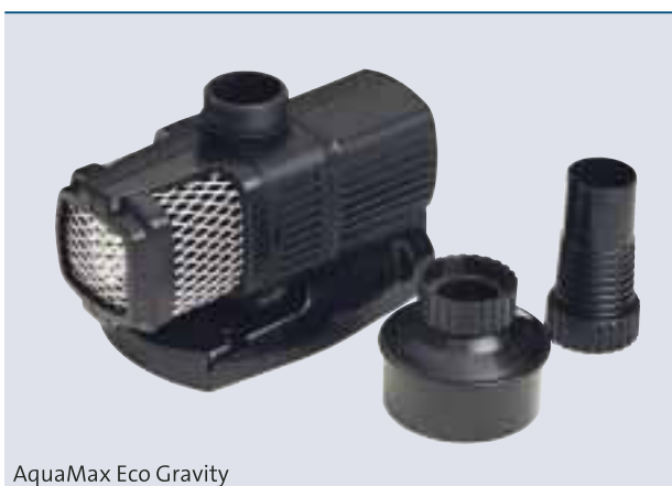
AquaMax Eco Gravity